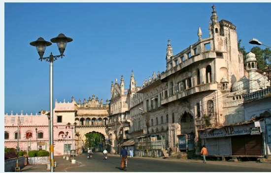
The royal Shaukat Mahal and Sadar Manzil

Upper and Lower Lake - Created by Raja Bhoj, by constructing an earthen dam across the Kolans river, the Upper lake with a catchment area of 361 sq km is the source of drinking water, fish and water chestnuts. It drains into the Kaliasot river and the outflow of water is controlled by a weir called Bhadbhada, located on the south-east corner. The Lower Lake- It was created in 1794 by Nawab Chhote Khan, minister of Nawab Hayat Mohammad Khan. With an area of 1.3 sq km and a catchment area of 9.6 sq km, the Chhota talab drains in to the Halali river.