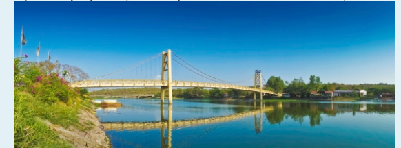
The foot bridge of Sair Sapata

Van Vihar : The safari-park is located on a hill adjacent to the Upper Lake, with an area of 445 hectares. In these natural surroundings, wildlife watchers can view a variety of herbivorous and carnivorous species. Open everyday, except Tuesdays, from 7 to 11 am and 3 to 5.30 pm.