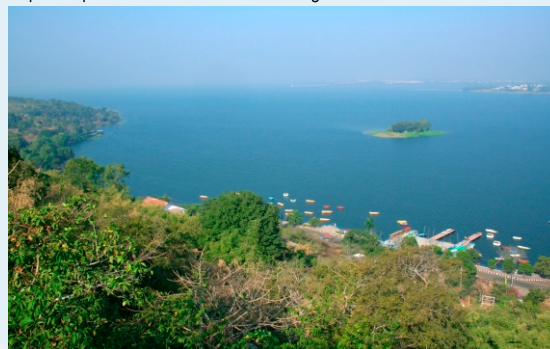
Upper Lake, the engineering feat of 11th century

Indira Gandhi Rashtriya Manav Sangrahalaya : Situated in 200 acres of picturesque site at Shamla Hills overlooking the Upper Lake, the Indira Gandhi Rashtriya Manav Sangrahalaya is the largest open-air anthropological museum in India. Established in 1977, this Museum depicts the story of humankind in time and space through its Open Air and Indoor Exhibitions, consisting of Tribal Habitat, Coastal Village, Desert Villa, Himalayan Village, Mythological Trail and Traditional Technology, constructed by the concerned ethnic groups using raw materials brought from their respective localities. The Veethi Sankul, the Indoor museum depicts topics related to the human biological and cultural evolution.