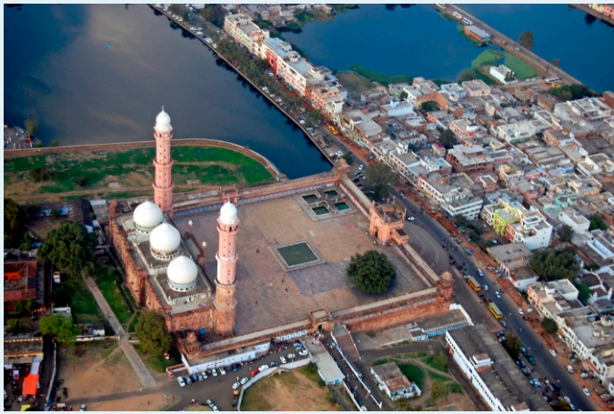
The imposing Taj-ul-Masajid

B hopal, capital of Madhya Pradesh, combines scenic beauty, historicity and modern urban planning. It is situated on the site of an 11th century city, Bhojapal, founded by Raja Bhoja. The founder of the existing city was, however, an Afghan soldier of fortune, Dost Mohammed (1708-1740). Fleeing from Delhi in the chaotic period that followed Aurangzeb's death, Dost Mohammed met the Gond queen Kamlapati, who sought his aid after the murder of her consort.