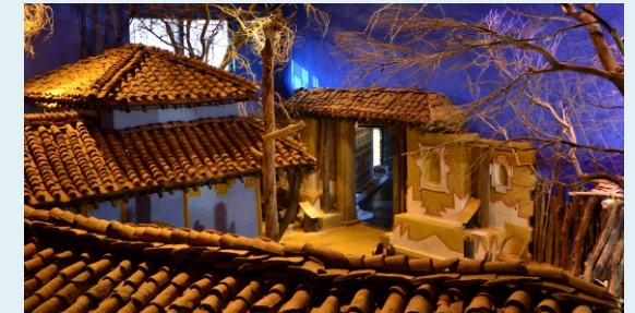
MP Tribal Museum, the home of rural art

MP Tribal Museum : The Museum is represents the tribal heritage of the state under one roof through life size replicas of the tribal habitat, temples, granaries, pictures and statues. Chhatisgarh is the guest state of the museum. There is a souvenir cum book shop where one may find tribal jewellery.